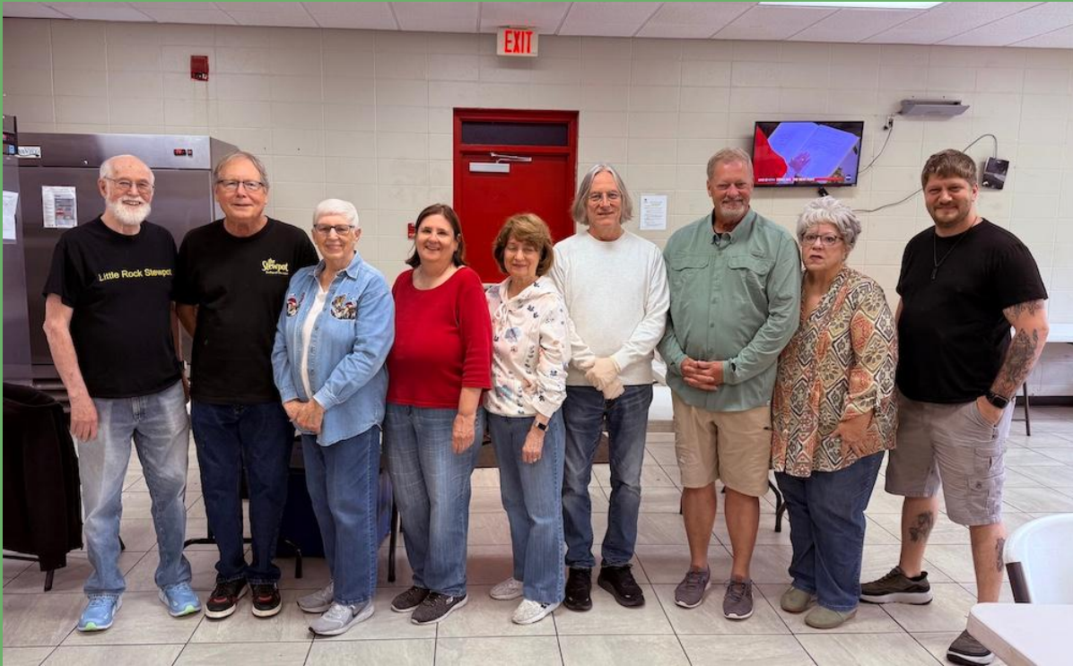
Some of the 1st Wednesday Group

seasoning, sauteed onions and green peppers and a little dash of love.